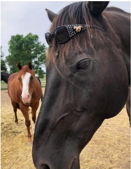
You can meet Cherokee, the horse!

Get ready to judge the Chili and Soup Cookoff!