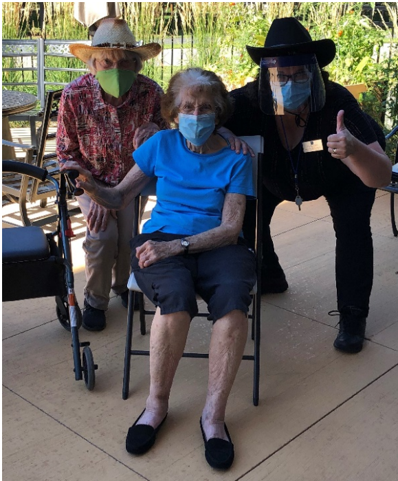
Square Dance Cardio Exercise Cowboy hats optional!